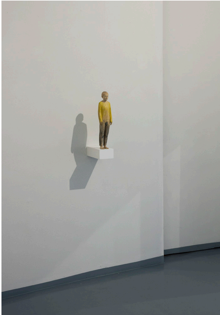
Boy 2018 cm 55x13x25,5 painted wood