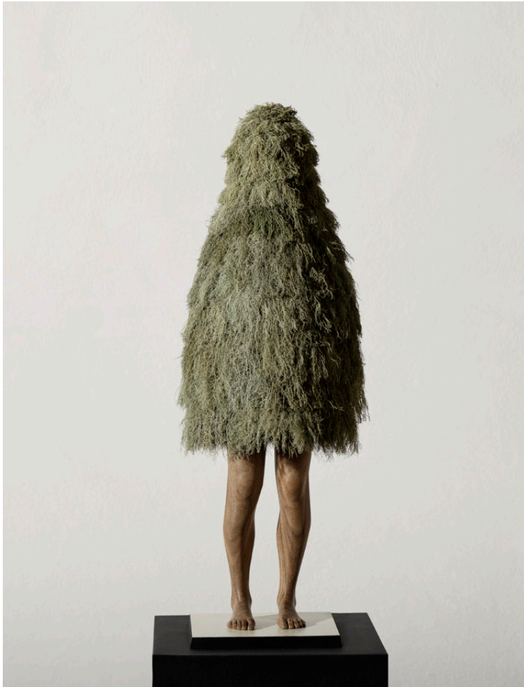
Nest 2018 cm 49x17x14 wood, lichens