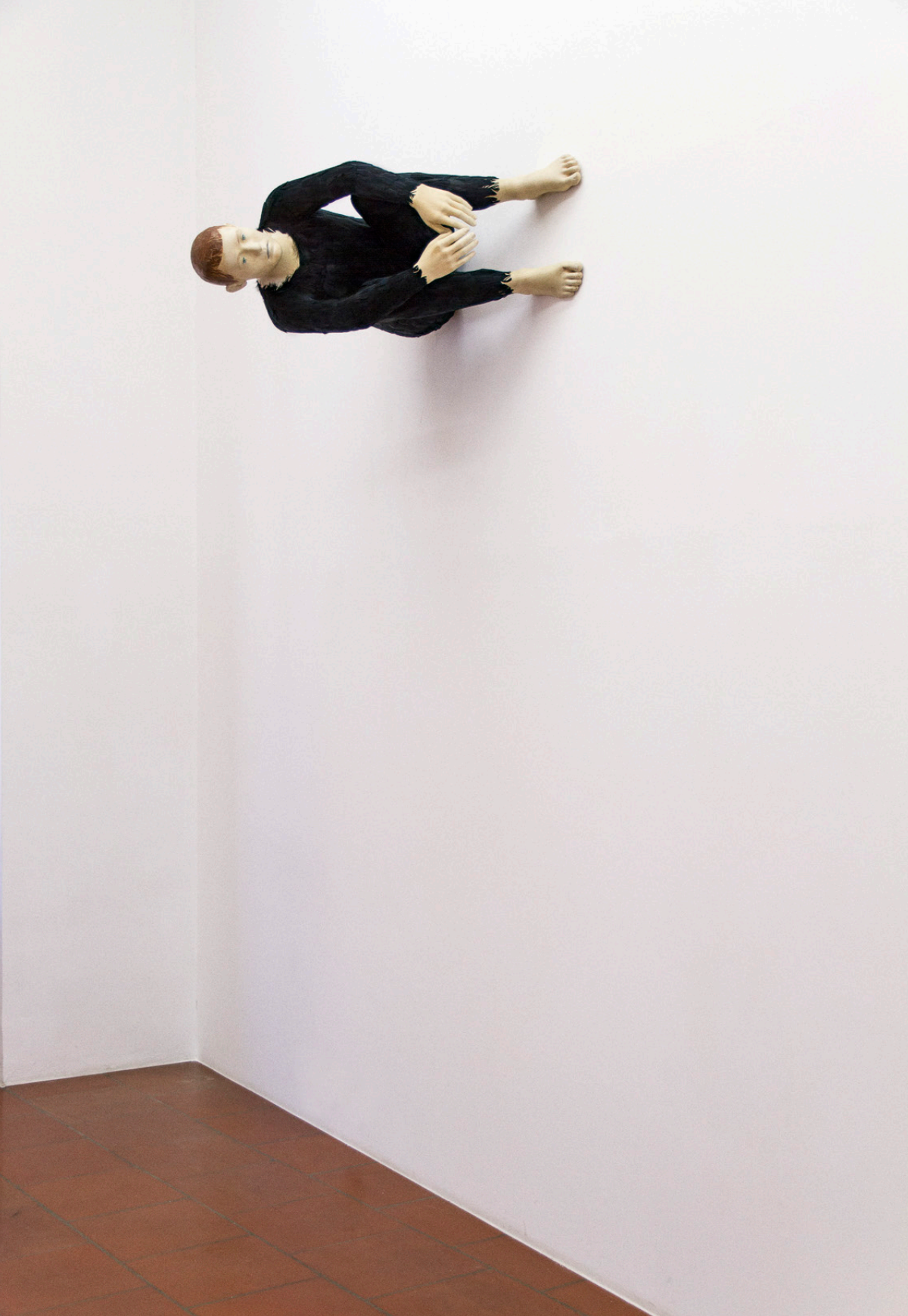
Forget me not 2016 cm 90x85x48 painted wood, feathers