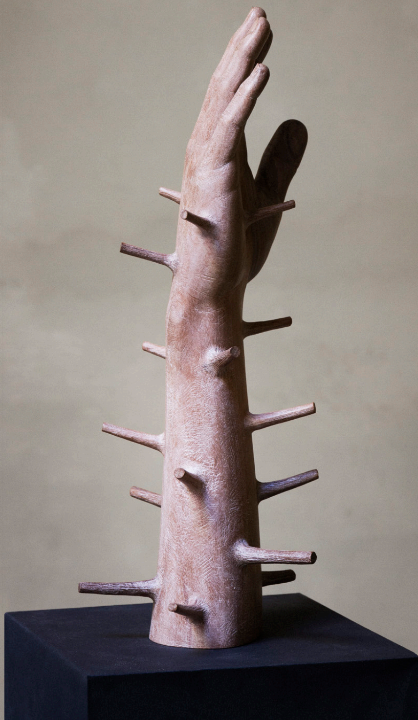
Regrowth 2018 cm 46,5x19,5x17,5 painted wood