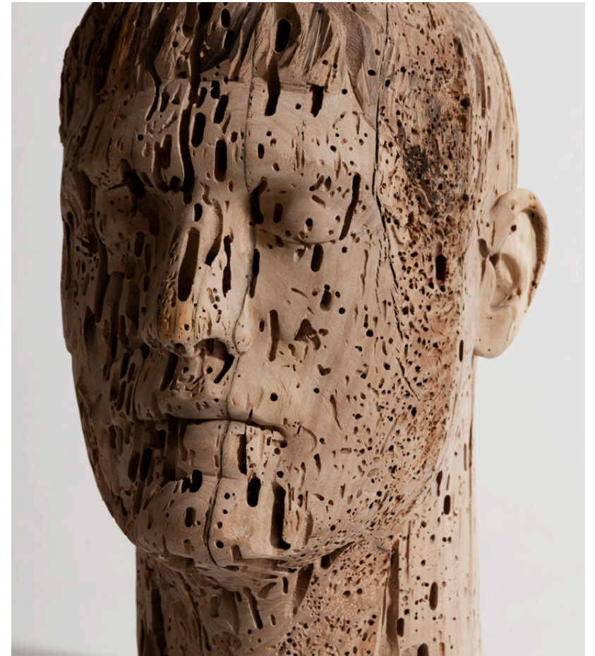
Nature doesn't care 2019 cm 30x19,5x25 walnut wood