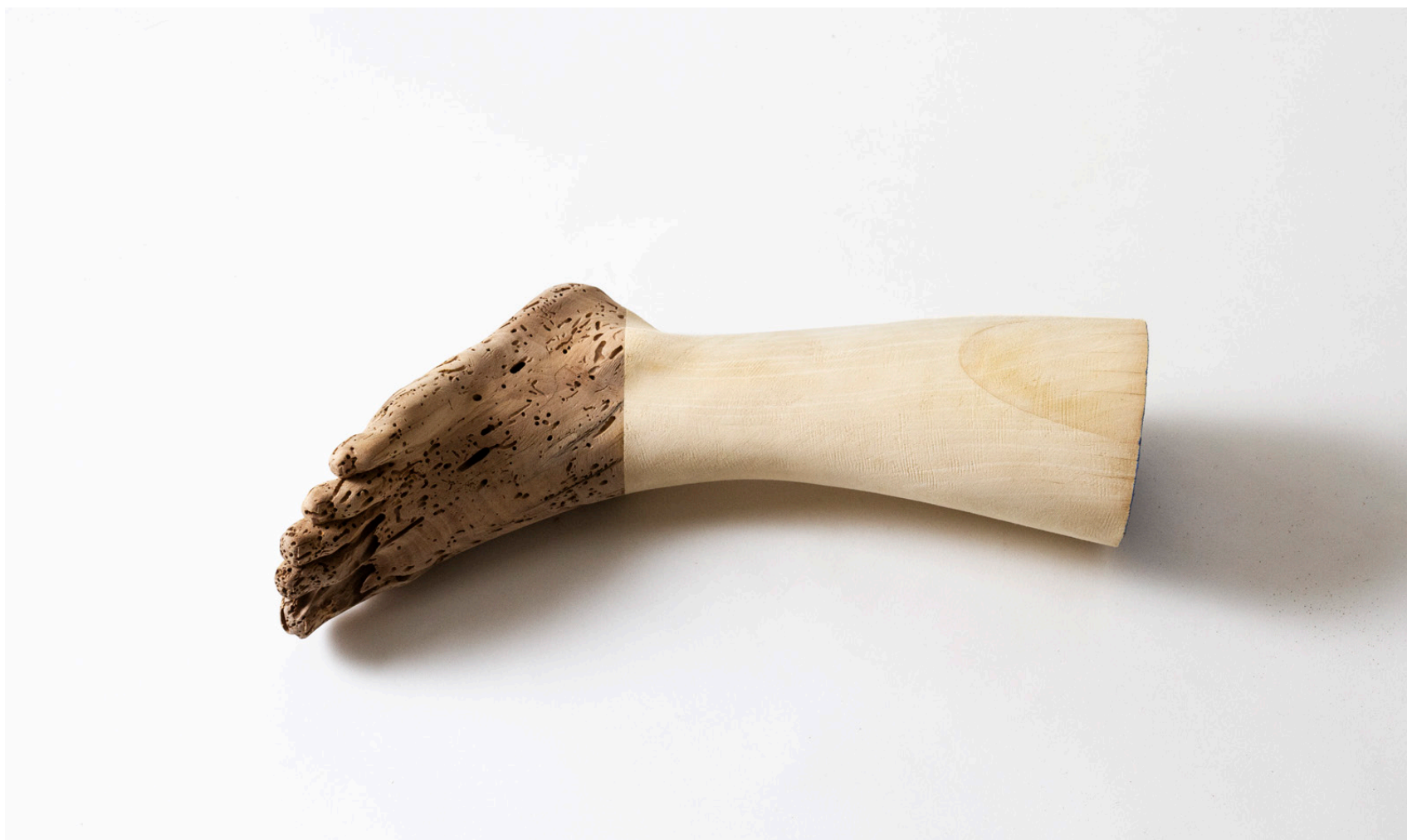
Transitory body 2019 cm 33x16x37 painted wood, feathers