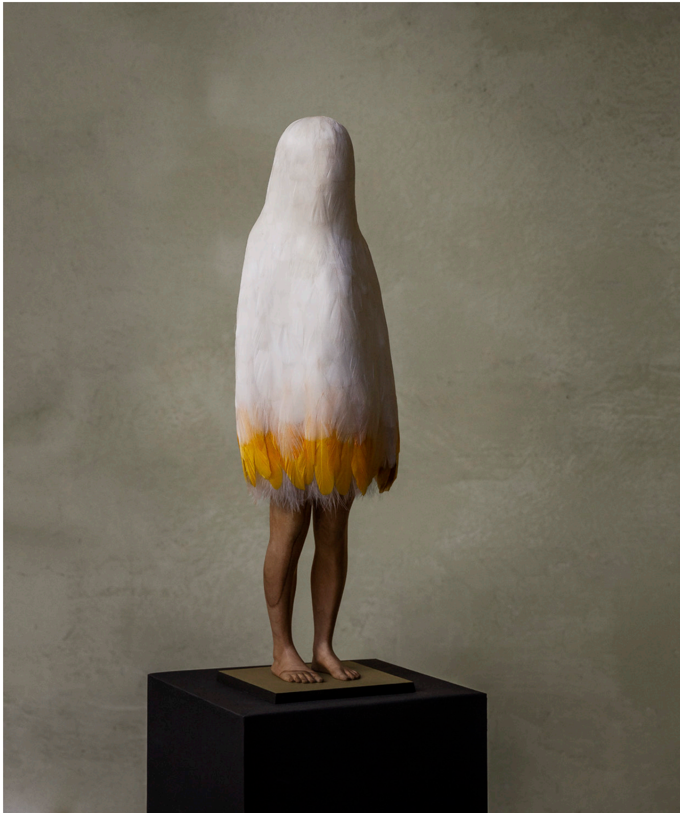
Mask (moulting) 2018 cm 48x15x14 painted wood, feathers