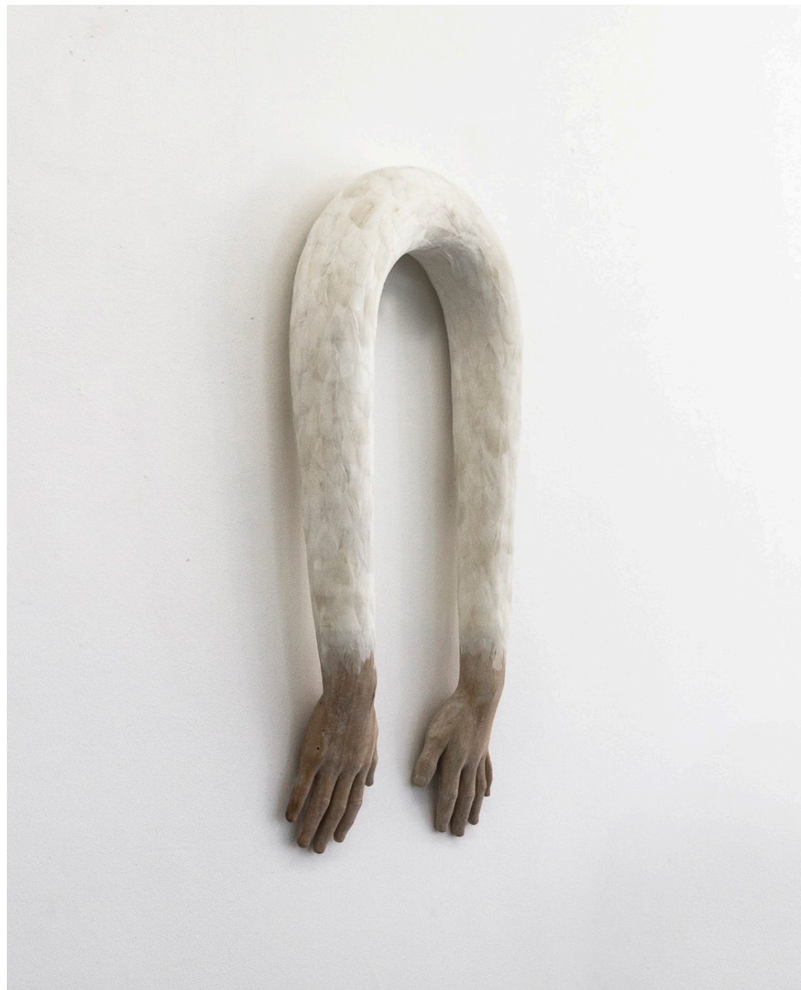
Shapeshifter 2019 cm 80x39x10 painted wood, feathers