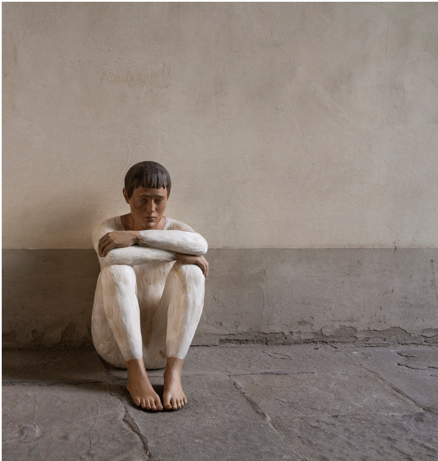
The double (forget me not) 2018 cm 76x41x62 painted wood, feathers